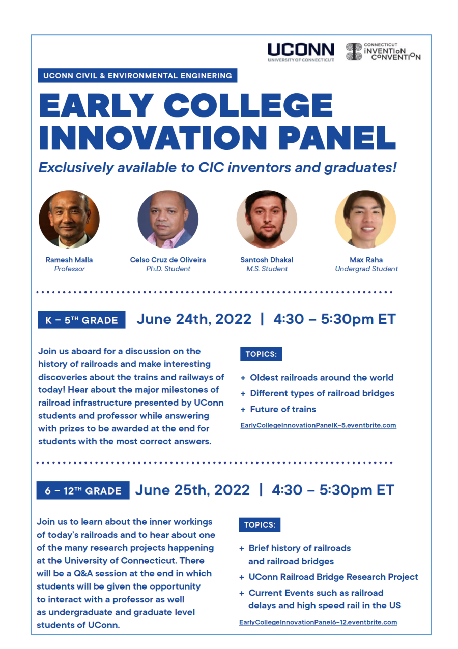
Figure 3 – K-5 grade students and 6-12 grade students Presentation Flyer