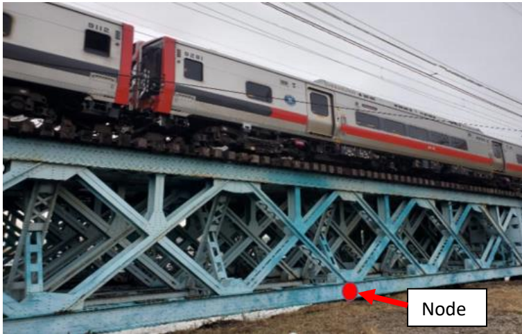
Figure 1 – Cos Cob Bridge, (CT), Span 3

Please add figures/images that can be included on the website and/or in marketing/social media materials to further clarify your research to the general public. This is very important to our Technology Transfer initiatives.