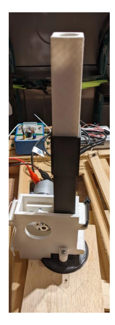
Figure 2 Extended version of acoustic sensor arm