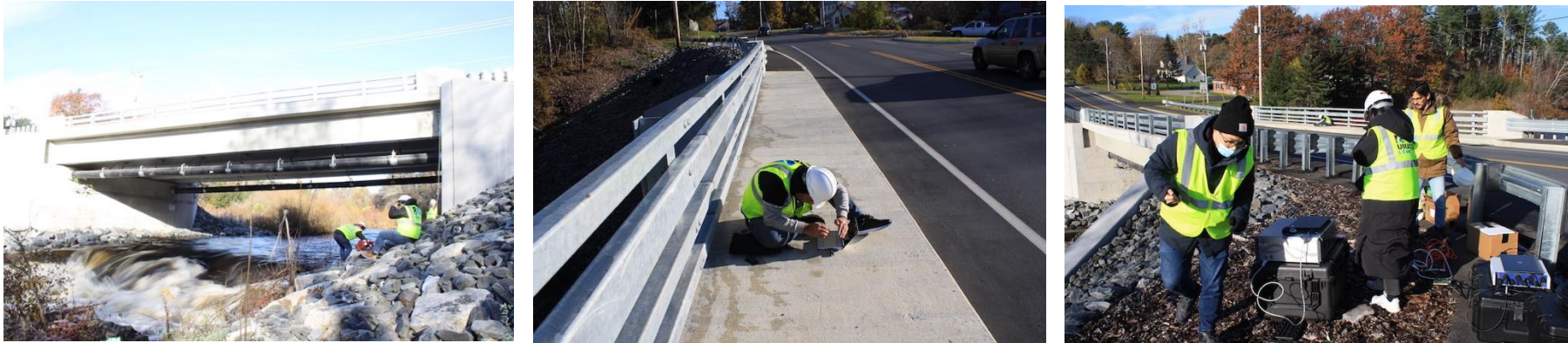
(a) Checking the condition of installed sensors. (b) Installation of an accelerometer on the bridge (c) Setup of optical sensor data collection system Fig. 1. Preparation of field data collection at Grist Mill Bridge, Hampden, ME during November 3~4, 2021

Our field test photos are shown in Figures 1 and 2. From our field test result, we have found that most of the installed sensors are functioning after one year in service.