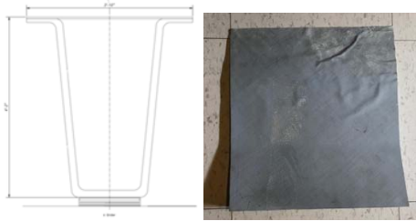
Fig. 2. Detailed cross section of a composite bridge girder and composite sample (by AIT Bridges)