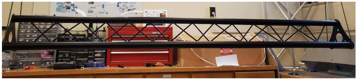
Figure 4. Metallic truss structure for future testing.

For the next reporting period it is planned to keep the study on how to improve this algorithm for damage identification and as a goal create a model for damage localization. In parallel it is planned to start tests comparing the camera-based and traditional sensing to metallic truss structures, which has higher natural frequencies if compared to the truss model. Figure 4 shows how the truss structure is and its boundary conditions for the testing. It is also planned tests in a real truss bridge inside the campus of the University of Massachusetts, Lowell.