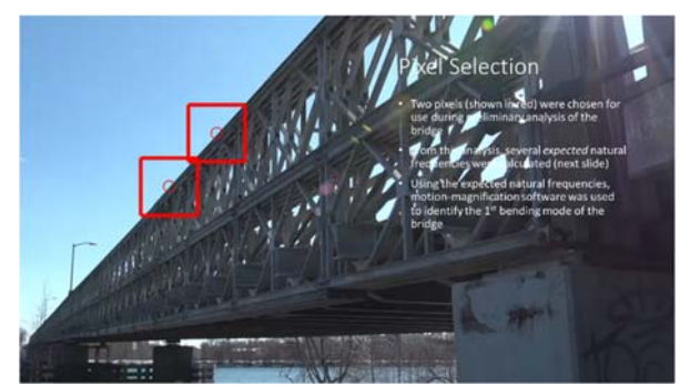
Figure 1: Recorded image/video data on Rourke bridge and selected pixels

The project started a few months ago in researching the capability of applying computer vision analysis to magnify the motion captured by video cameras and identify the structural dynamics. The team has leverage the previous research on phase-based motion magnification to extract the modal information of a bridge in a portable, non-contact, and inexpensive way. Figure 1 below demonstrates the phased-based motion magnification to the videos captured at the Rourke bridge across Merrimack River in the last reporting period.