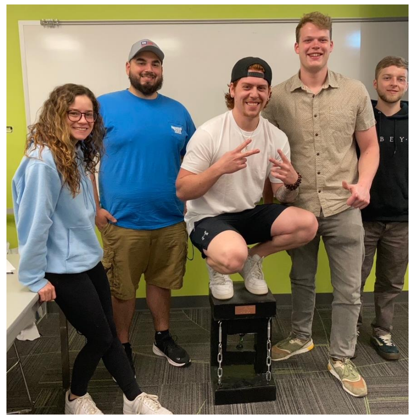
Fiber-reinforced ECM Tensional Integrity (Tensegrity) Structure Designed by WNE Undergraduate Civil Engineering Students.

Students who enrolled in CEE 451, Construction Materials, designed and made a tensegrity structure made of the fiber-based ECM.