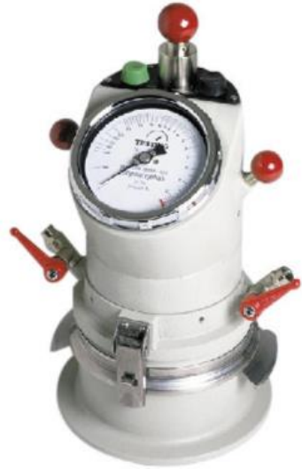
Fig:- 0.75 liter air meter

Please add figures/images that can be included on the website and/or in marketing/social media materials to further clarify your research to the general public. This is very important to our Technology Transfer initiatives.