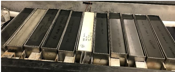
Fig:- Freeze thaw table