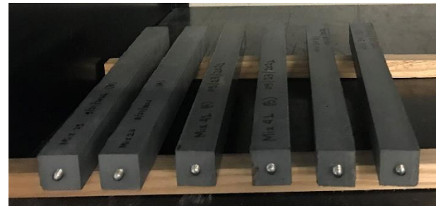
Fig:- Shrinkage beams