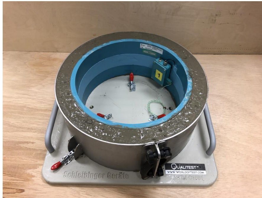
Figure 1 Shrinkage test ring with freshly cast concrete