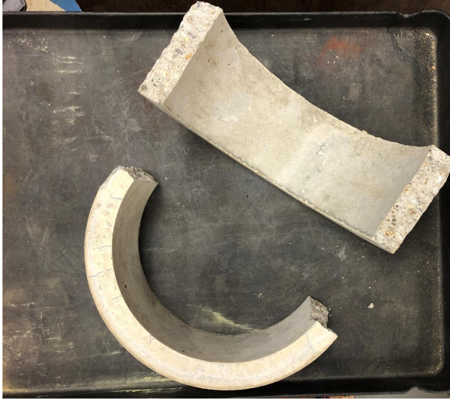
Figure 4. Concrete ring following removal from shrinkage test ring

Describe any additional activities involving the dissemination of research results not listed above under the following headings: Undergraduate students Matt Kaplita and Josh Allen were recognized for their contributions to the project as part of TIDC Student Recognition Night 2021.