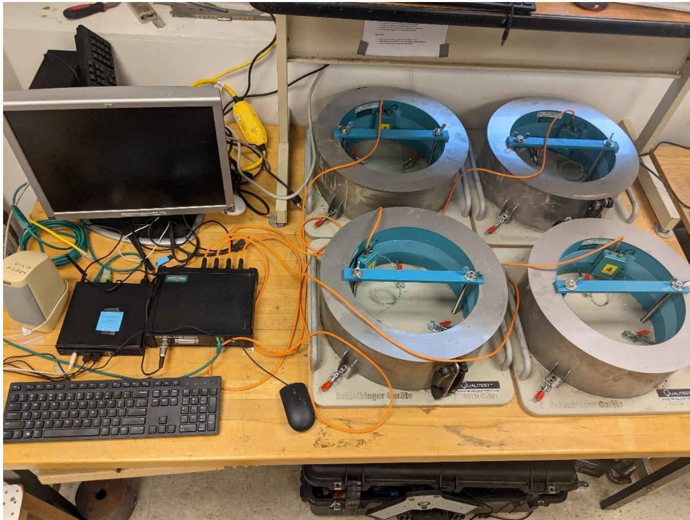
Figure 1 Shrinkage rings testing four different types of bag cement

Please add figures/images that can be included on the website and/or in marketing/social media materials to further clarify your research to the general public. This is very important to our Technology Transfer initiatives.