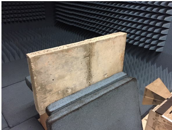
(a) Laboratory radar imaging

In Task 2 , we have collected preliminary radar images using a SAR (synthetic aperture radar) sensor in our radar lab and a GPR (ground penetrating radar) in the field (Lincoln St. Bridge, Lowell, MA), as shown in Figure 2. We will continue collecting radar images in the lab and in the field.