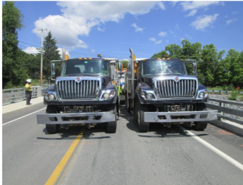
Figure 2: MaineDOT Wheeler Dump Trucks in Position for Load Test of Hampden Grist Mill Bridge 7/13/2022

Describe any additional activities involving the dissemination of research results not listed above under the following headings: