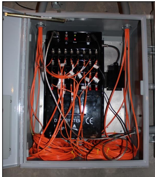
Figure 3. Fiberoptic strain sensor system in junction box showing sensor wiring from all six stay anchorages.