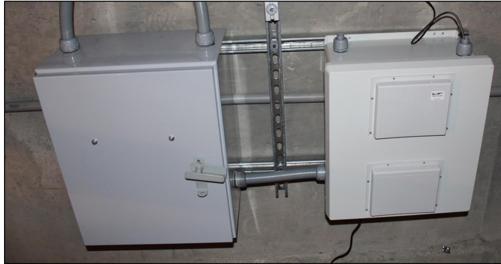
Figure 2. Pylon base station showing the junction boxes for the fiberoptic strain sensor system (left) and DAQ computer (right).