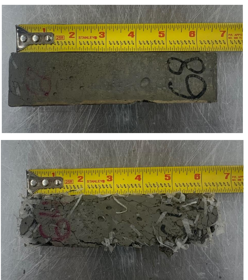
Figure 2. After 168 freeze-thaw cycles; 0.24 wt% active fiber specimen with minimal damage (top) and 2% passive fiber specimen with significant damage (bottom)