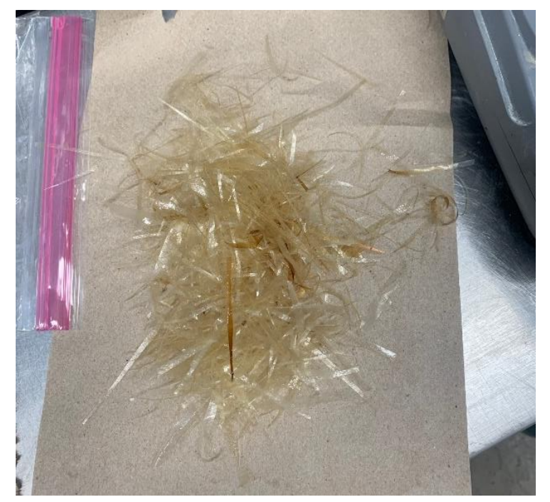
Figure 1. Chitosan fiber produced by improved manufacturing technique

Freeze-thaw testing examined the ability of shrinking fibers to enhance the durability of mixes. A hypothesis is that shrinking during curing reduces micro-voids, which resist water penetration. The results of the freeze-thaw testing are quite promising with specific mix ratios surviving much longer than other mix ratios, use of passive preshrunk fibers, and no fibers. Figure 1 shows a mass of chitosan fibers using an improved manufacturing method. Figure 2 shows concrete samples with active shrinking fibers and passive pre-shrunk fibers, with the active fiber beams performing much better. Figure 3 plots the freeze-thaw performance of concrete beam samples with various mix ratios and compositions using fundamental frequency of vibration as a measure. The beams with active shrinkage fibers in 1% and 2% weight mix ratios clearly performed the best.