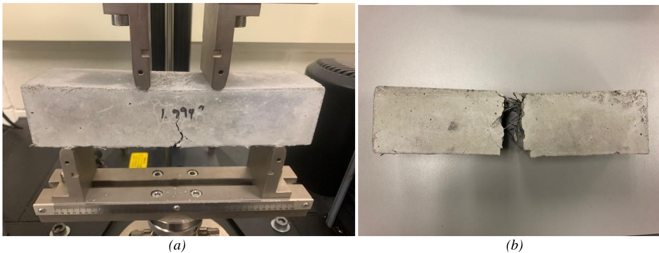
Four-point bending test on a fiber reinforced ECM beam (a) and a broken beam after test (b)