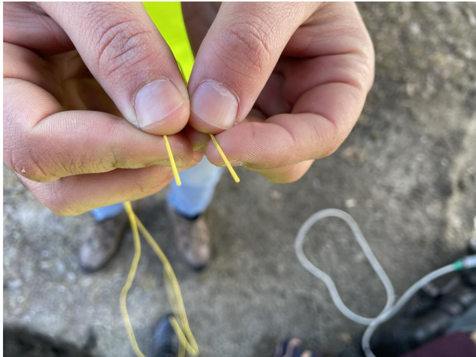
Figure 1 The fiber broke due to the aging of plastic coating.