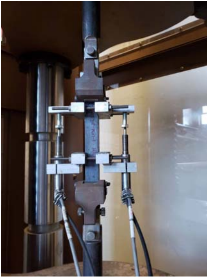
Fig:- Direct Tension Test Setup