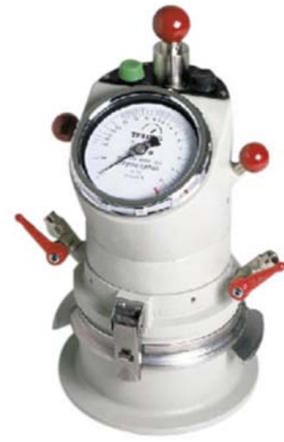
Fig:- Air Content Test Apparatus