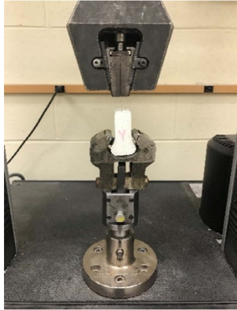
Fig:- Fiber Pullout Test Setup