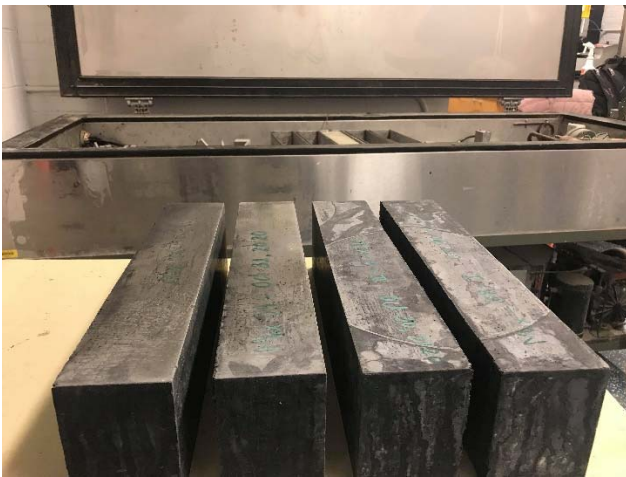
Fig:- Freeze Thaw Table